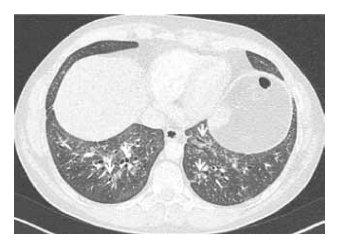
FIGURE 3. Fine reticulation and areas of increased attenuation (ground glass) following a peribronchial distribution. There is mild bronchial distortion (white arrows). Characteristically, the abnormal findings spare the subpleural area (subpleural sparing). This is a pattern most consistent with a non-IPF diagnosis. Surgical lung biopsy demonstrated findings compatible with hypersensitivity pneumonitis.

TABLE 1. Fleischner Society diagnostic criteria for IPF. Clinical implications