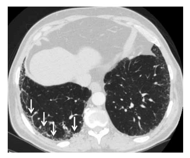
FIGURE 2. Fine reticular pattern with traction bronchiolectasis (white arrows). No honeycombing is seen. According to the 2011 ATS/ERS/JRS/ALAT guidelines this is a possible UIP pattern and a surgical lung biopsy is mandatory to secure diagnosis. According to the diagnostic criteria by Fleischner society this is considered a probable UIP pattern and in the appropriate clinical setting a diagnosis of IPF can be established without the need for tissue confirmation.

As mentioned earlier, there are cases where SLB is necessary to secure diagnosis. However, in clinical practice this is not always feasible for a variety of reasons,